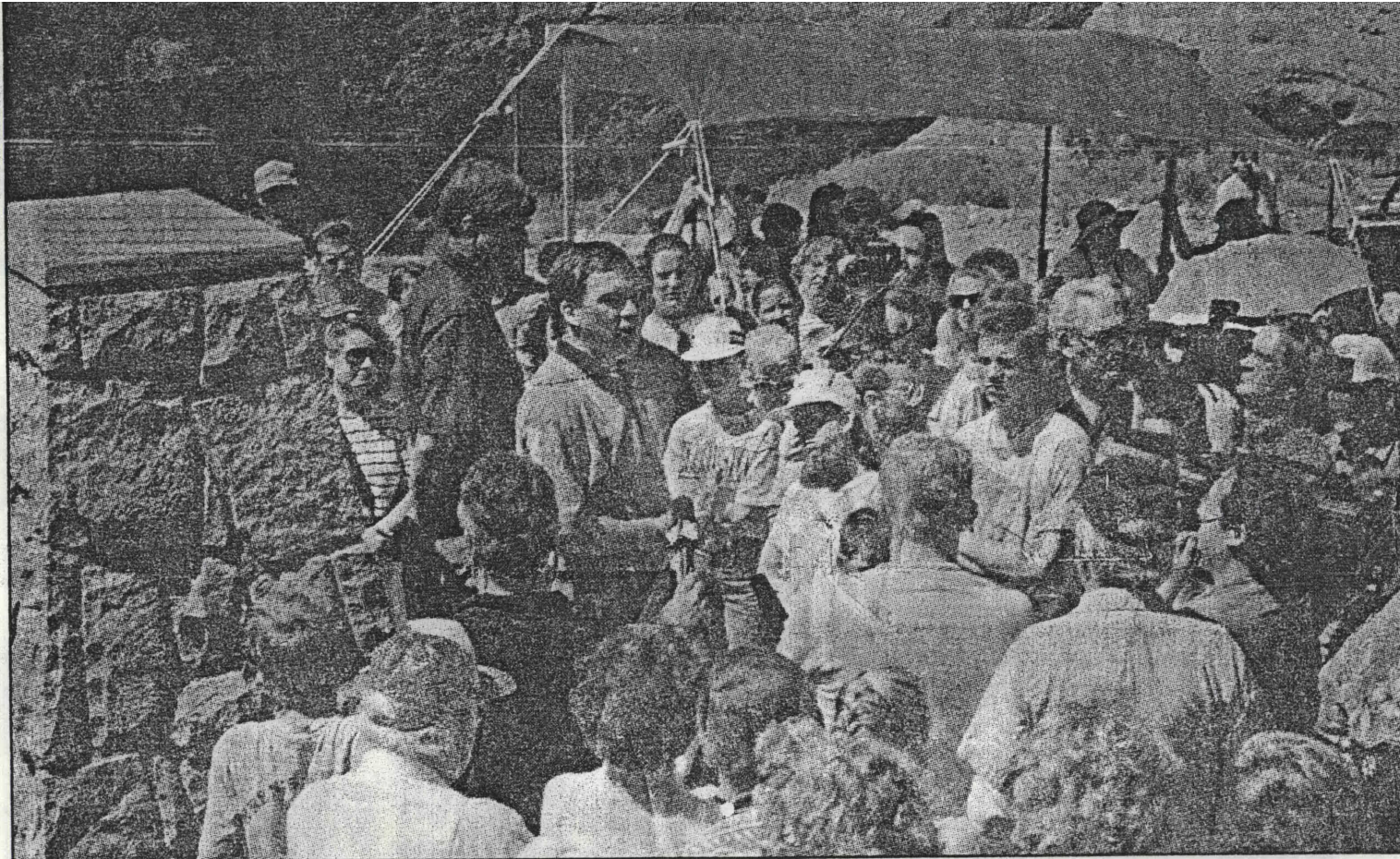
Family members and friends of those who died or survived the truck wreck gather for dedication of the red sandstone marker.